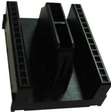
***spare part*** SIMATIC S7, bus connector (spare part)